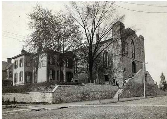
The first church erected by the Alton congregation, which housed the Young Ladies School and the Advanced School.