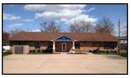
Masonic Lodge, Glen Carbon IL

Newsletter of the Metro East Unitarian Universalist Congregation