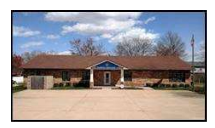
Masonic Lodge, Glen Carbon IL

Newsletter of the Metro East Unitarian Universalist Congregation