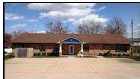
Masonic Lodge, Glen Carbon IL

Newsletter of the Metro East Unitarian Universalist Congregation