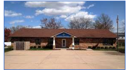
Masonic Lodge, Glen Carbon IL

Newsletter of the Metro East Unitarian Universalist Congregation