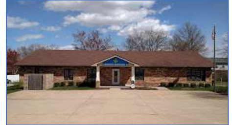
Masonic Lodge, Glen Carbon IL

Newsletter of the Metro East Unitarian Universalist Congregation