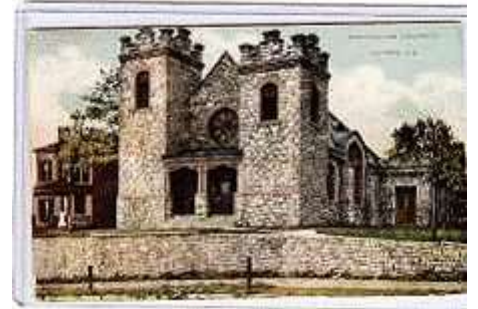
Congregation established 1836