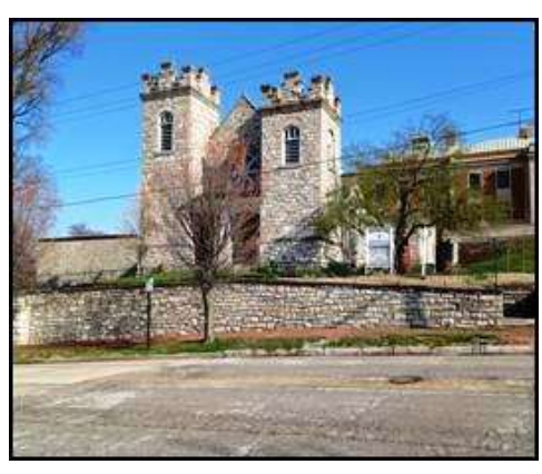
Congregation established 1836