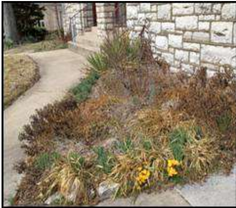
The crocus announce the coming of spring in spite of the ongoing evidence of winter.