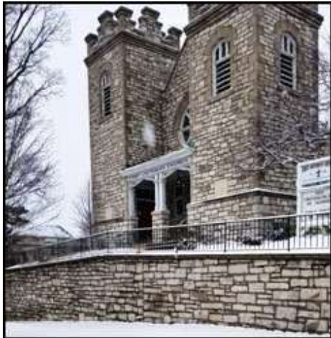
Congregation established 1836