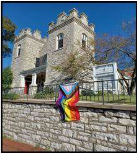
Congregation established 1836