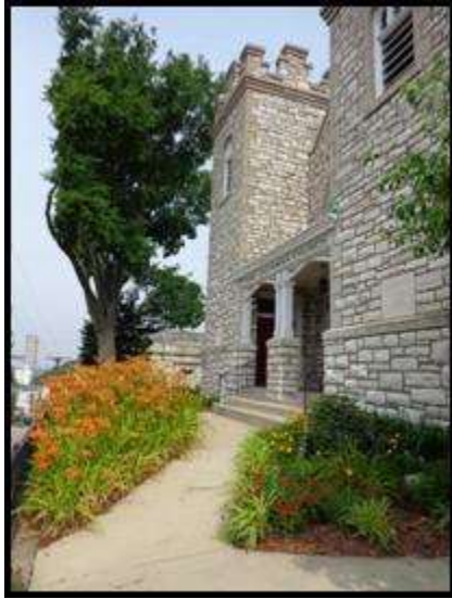
Congregation established 1836