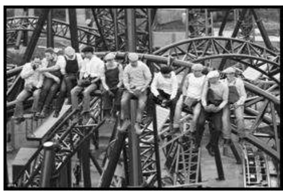
Men's Group Lunch Thursday, June 9 11:30 a.m.

Finally, a gentle reminder – we expect all those attending to be vaccinated and, best case, boosted.