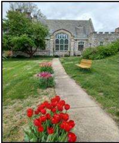
Congregation established 1836.