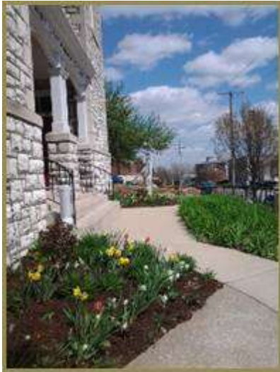
Congregation established 1836.

Newsletter of the First Unitarian Church Alton, Illinois 110 East 3 rd St. (location) PO Box 494 62002 (mail)