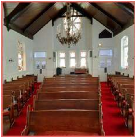
Congregation established 1836.

Newsletter of the First Unitarian Church Alton, Illinois 110 East 3 rd St. (location) PO Box 494 62002 (mail)