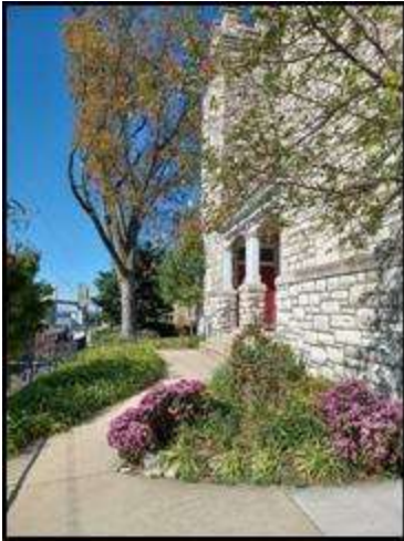
Congregation established 1836.