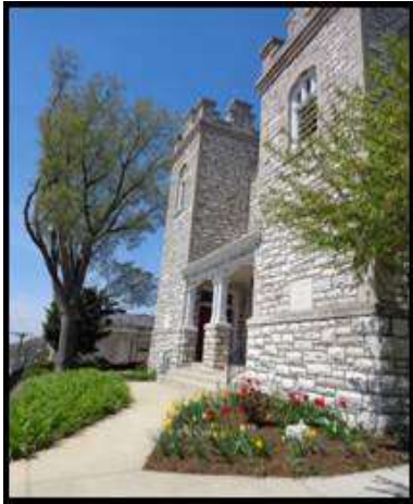
Congregation established 1836

Newsletter of the First Unitarian Church Alton, Illinois 110 East 3 rd Street. (location) PO Box 494 62002 (mail)