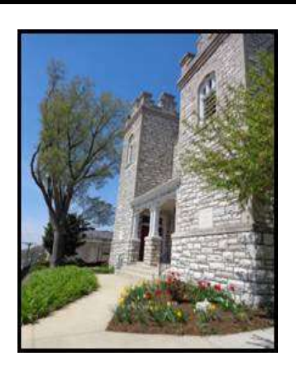
Congregation established 1836

Newsletter of the First Unitarian Church Alton, Illinois 110 East 3<sup>rd</sup> Street (location) PO Box 494 62002 (mail)