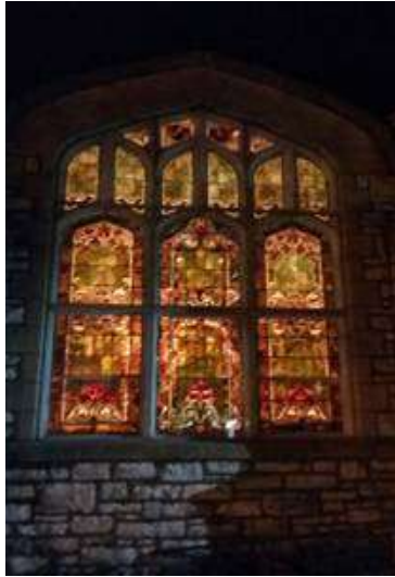
Congregation established 1836