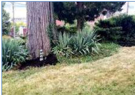
150-year old Elm tree in newly trimmed RE yard. Congregation established 1836