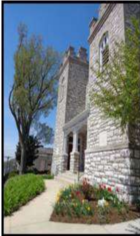
Congregation established 1836