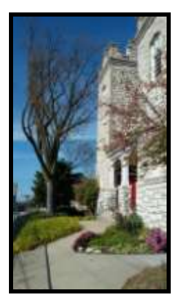
Congregation established 1836