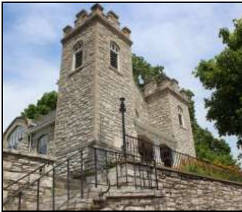
Congregation established 1836