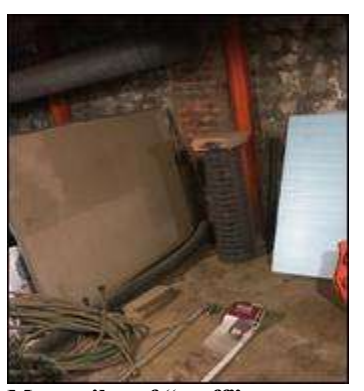
More piles of "stuff" to go