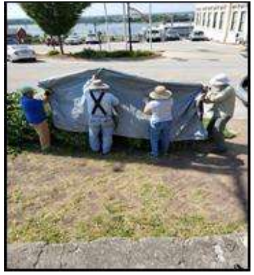
Dumping the brush for City pickup