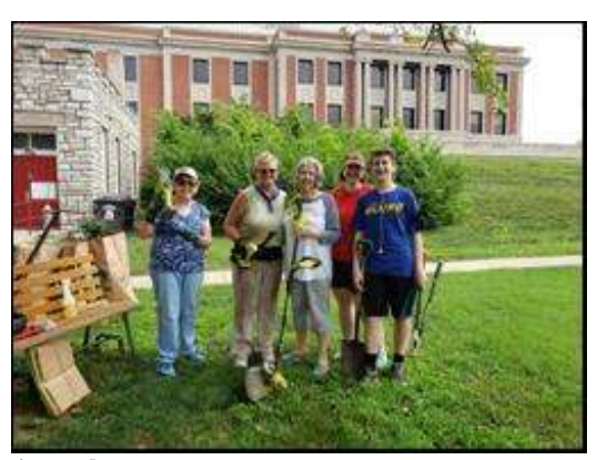
A work team