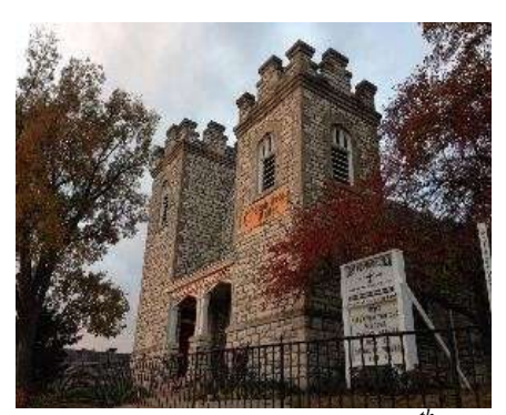
Congregation established Dec. 7<sup>th</sup>, 1836