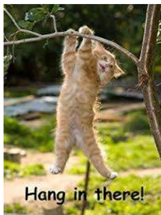
Hang in there!

After three months of our new fiscal year, now is a good time to take a big picture look at our finances. I have a responsibility to report to the Board and the congregation. Similarly, you, the loving, thoughtful members of this congregation, have a responsibility to attend to how we are doing, so you will be informed enough to