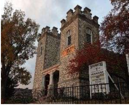
Congregation established 1836