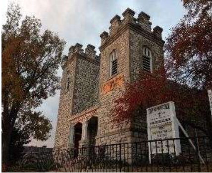
Congregation established 1836