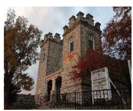
Congregation established 1836