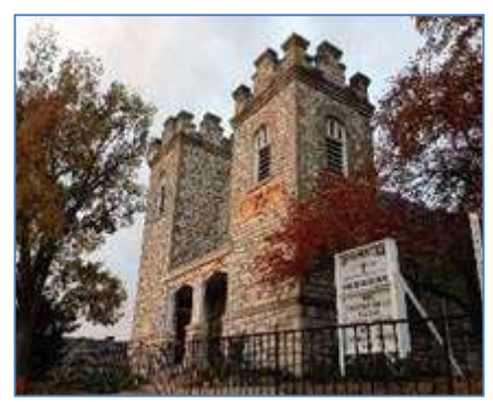
Congregation established 1836