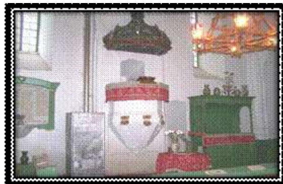
The sanctuary of the Unitarian Church in the village of Homoródalmás.