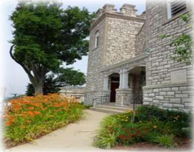
Congregation founded 1836; Current sanctuary built 1904