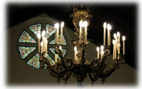
Interior window and chandelier