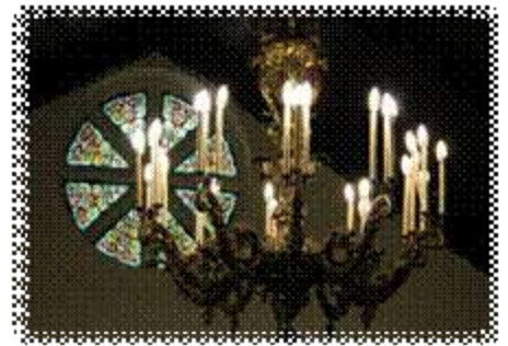
Interior window and chandelier