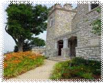
Congregation founded 1836; Current sanctuary built 1904