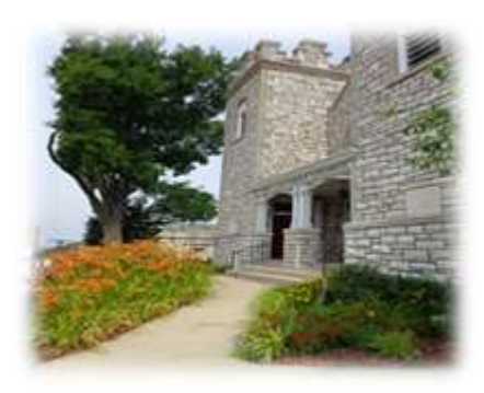
Congregation founded 1836; Current sanctuary built 1904