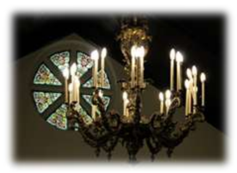
Interior window and chandelier