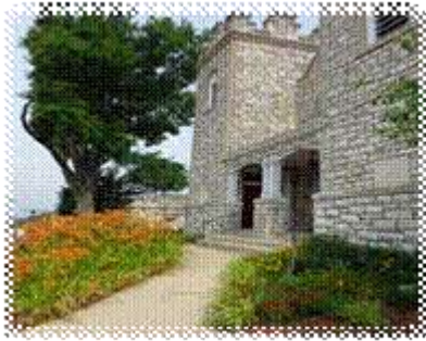
Congregation founded 1836; Current sanctuary built 1904