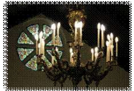
Interior window and chandelier