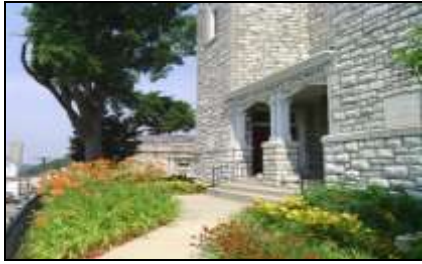
Flower garden in front of the church