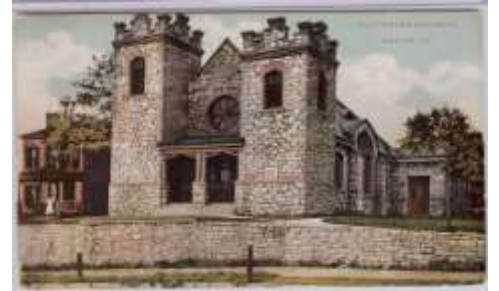
Church pictured in 1909 postcard