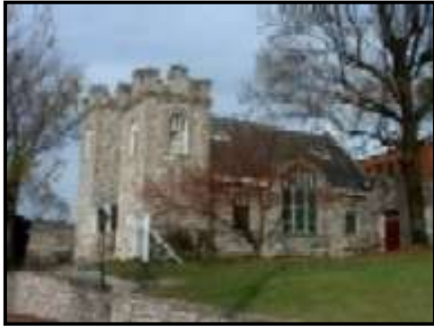
Congregation founded 1836; Current sanctuary built 1904