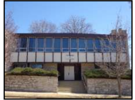
Religious Education Wing built 1969; New windows and façade 2014