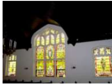
Windows on the west side of sanctuary