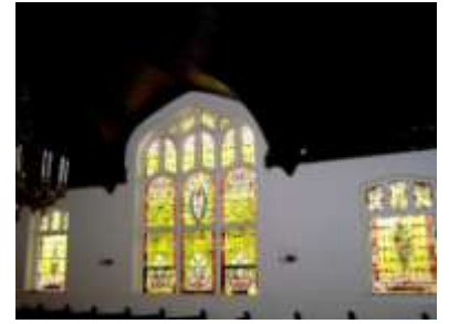
Windows on the west side of sanctuary