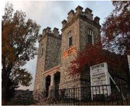
Congregation established 1836